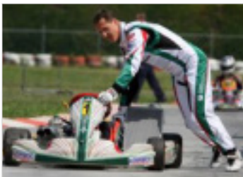
Michael Schumacher Karting