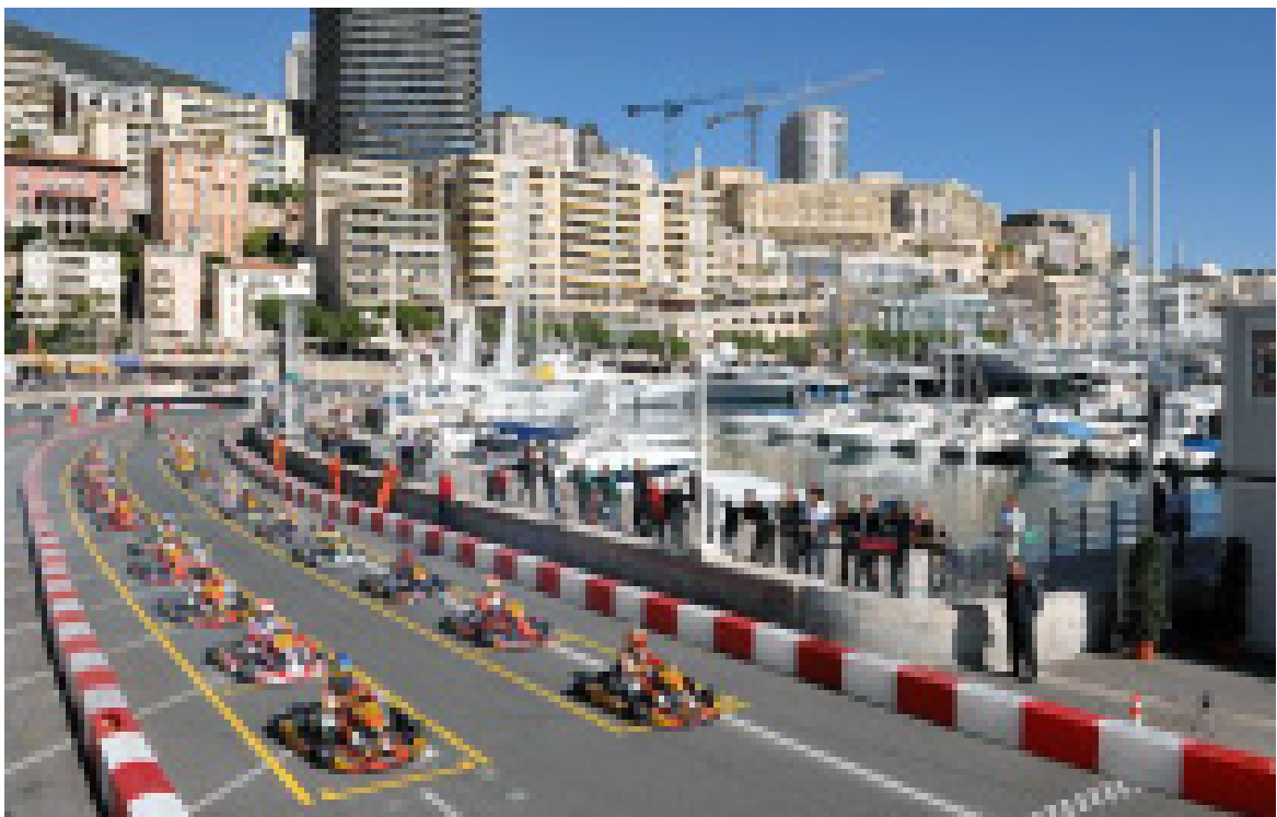
Monaco Kart Event