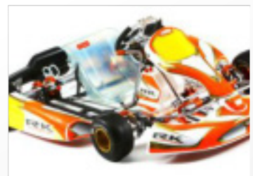
The RK kart, Also known as Robert Kubica