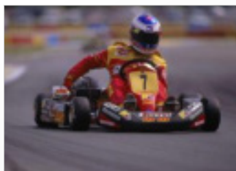
Already a World Champion Jenson Button