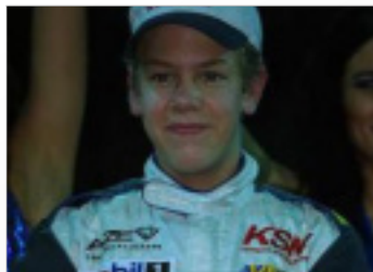
A young Champion, Sebastian Vettel