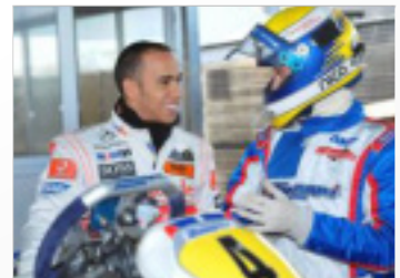
Lewis Hamilton & Nico Rosberg testing Chassis